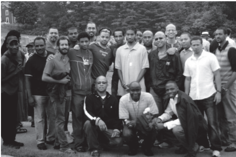
The Black Men's Gathering

needed to dissolve the hardness, the aloofness, the furrowed brows that were the protective shields we brought in from battles with a perverse world. It was primarily the moistening power of prayer that dissolved the clay. Rousing, collectivist prayers channeled together the Divine Word and the Black experience of modernity. Voices golden and gravel contributed to praise-songs communally and spontaneously devised in sessions that could stretch for hours. The call-and-response structures of Black worship bound hearts; the drums talked beneath tablets that were recited in numerous languages; power