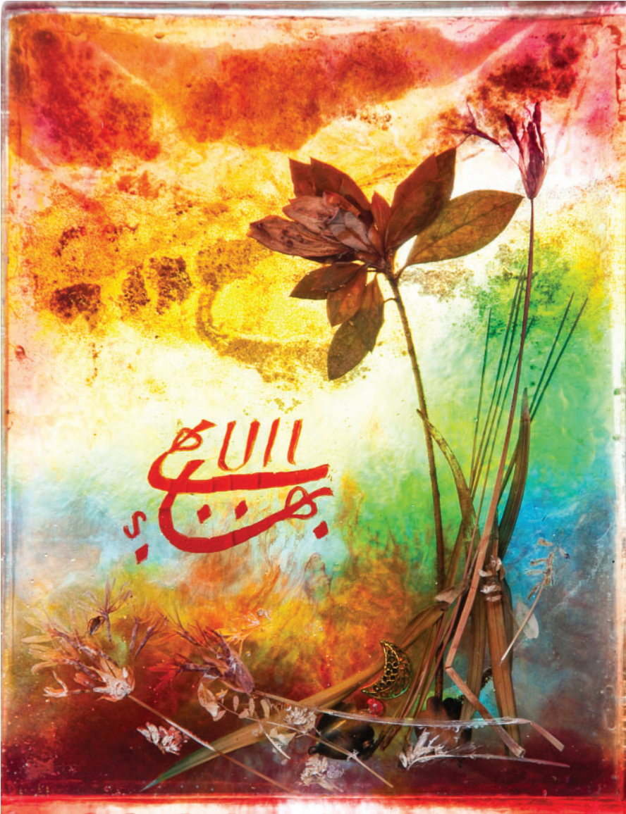
The Greatest Name M. BUNCH WASHINGTON