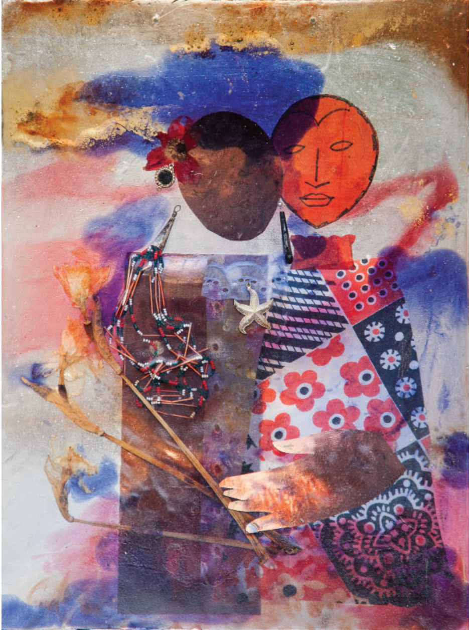
Two Seas M. BUNCH WASHINGTON